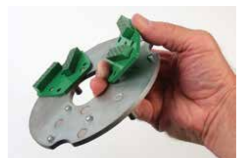
On machine or off, thumb or finger pressure easily leverages diamonds from the DIAMAG<sup>®</sup> plates.