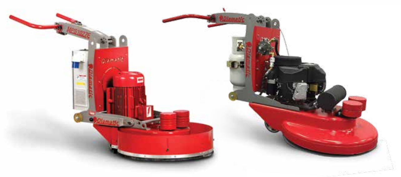
MPS-1027E 10hp available in 230 or 460v variable speed. Dust control shroud available for use with small concrete vac.