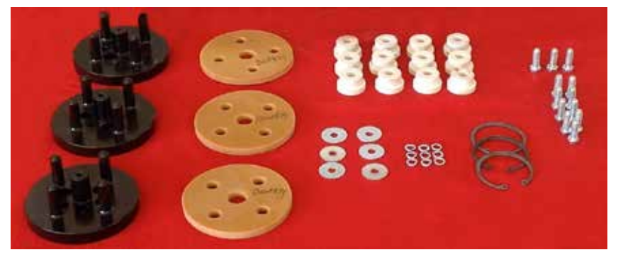
Bush Hammer Installation Required Parts